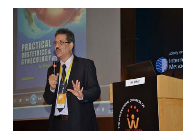
New Surgical Techniques at Midlife (Video Session)