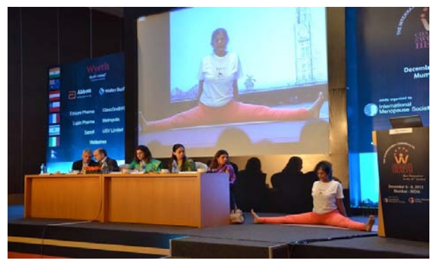
Fit at Fifty, Shapely at Sixty & Strong at Seventy