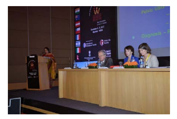
Customizing Menopausal Hormone Therapy

The 4 Pre congress Workshops were attended by more than 400 participants. The topics covered during the Workshops were "Customizing Menopausal Hormone Therapy, New Surgical Techniques at Midlife, Breast disease and the Gynaecologist and Fit at Fifty, Shapely at Sixty & Strong at Seventy". The workshops included video case presentations and live exercise demonstrations and were extremely interactive.