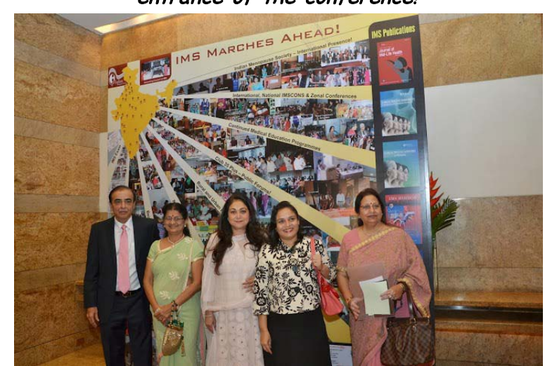
IMS- India activities showcased on a huge backdrop created & installed at the entrance of the conference!

The International Congress on " Challenges in Women's Health – New Dimensions in the 21<sup>st</sup> Century " was held between 6<sup>th</sup> to 8<sup>th</sup> December 2013 at Hotel Grand Hyatt, Mumbai, India. The Congress was jointly organized by the International Menopause Society (IMS) and the Indian Menopause Society (IMS-India) and was supported by the World Health Organization and the Ministry of Health, Government of India.