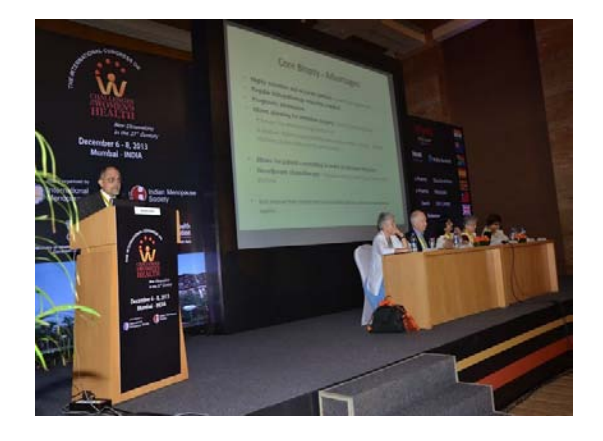
Breast disease and the Gynaecologist