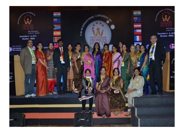
The Indian Menopause Society(IMS)team